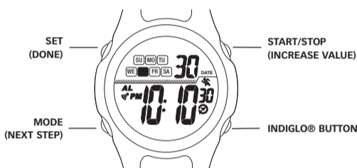
Button functions shown with setting functions in parentheses

Press MODE repeatedly to step through modes: Time, Stopwatch (SP), Alarm (AL), Timer (TR), and Time 2 (T2). Press MODE to exit current mode and return to Time mode.